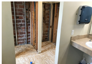
Left: Shining up our fraternal home. Right: Remodeling the second floor showers.

Last issue, we reported on redoing the flat roofs, a project we were able to complete during a mild week in January. The old roofs had allowed water to leak into the soffits below, and those will be fixed this summer.