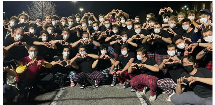
Our Lip Sync cast warming up in the C.Y. Stephens Auditorium parking lot for their performance.